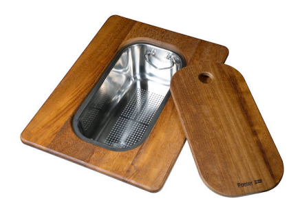
Iroko-wood sliding chopping board with stainless steel colander