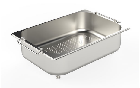
Stainless steel colander