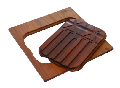
Iroko-wood twin chopping board