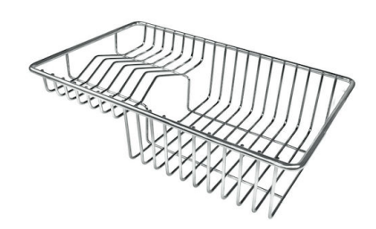
Stainless steel plate rack