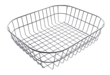
Stainless steel basket