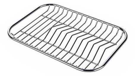
Stainless steel plate rack